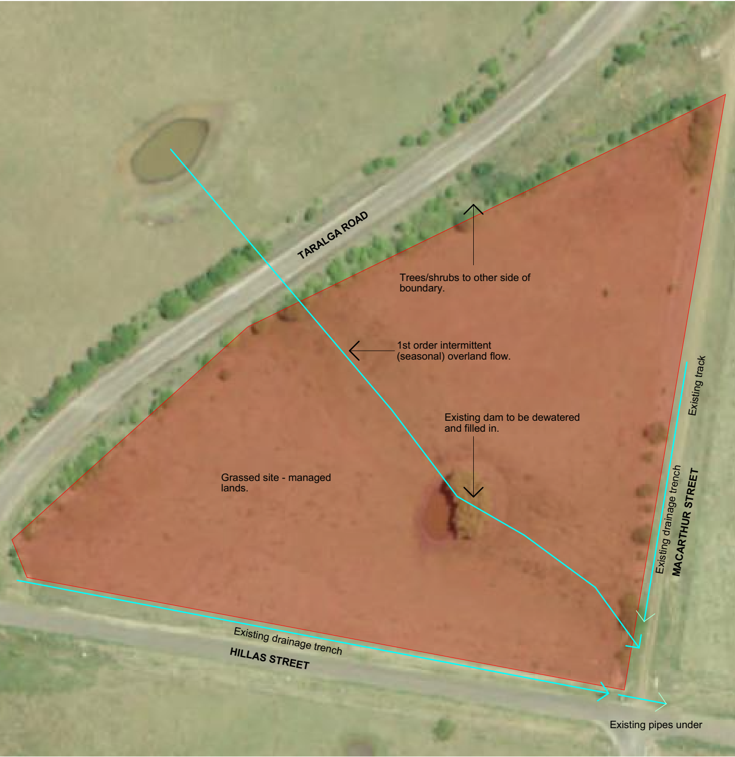
34 Hillas Street Aerial