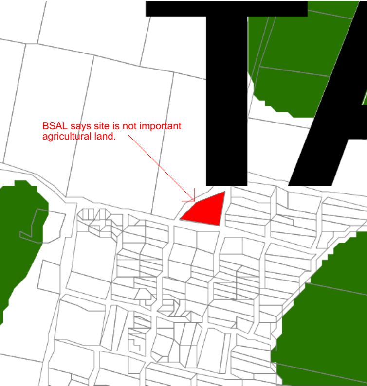
34 Hillas Street BSAL